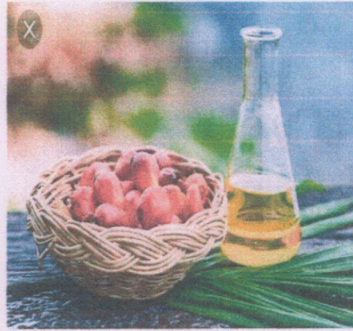
PALM - OIL